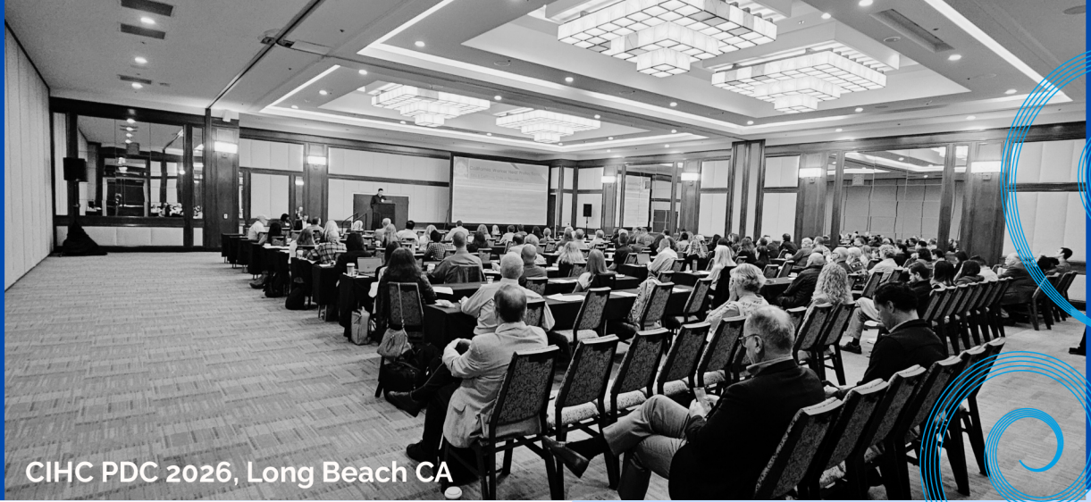
CIHC PDC 2026, Long Beach CA