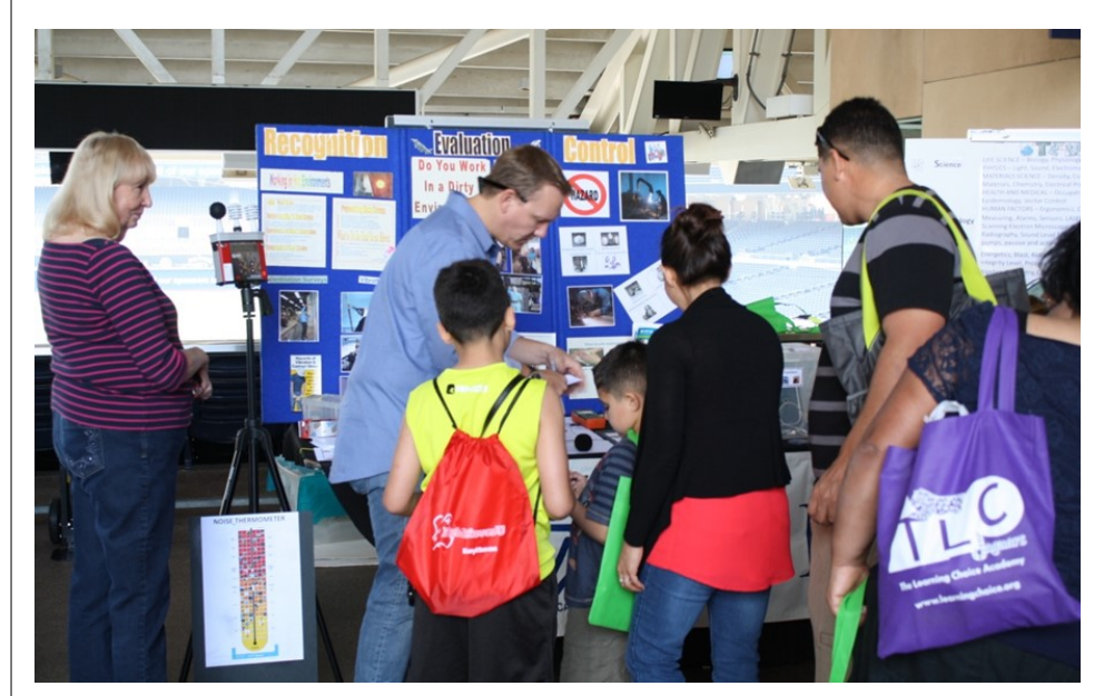
SDAIHA volunteers demonstrate industrial hygiene principles at the San Diego Festival of Science and Engineering Expo Day.